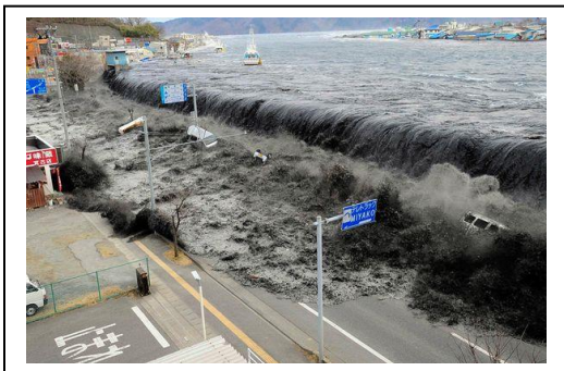
The 10 metre wave which swept over Japan destroyed buildings, cars, and harbours. The devastation is immense.

In the last issue, we talked about getting involved in the community or around the world. We are now being faced with a new disaster in Japan where help will be needed from all corners of the world. Here is a small breakdown of the events of the past week.